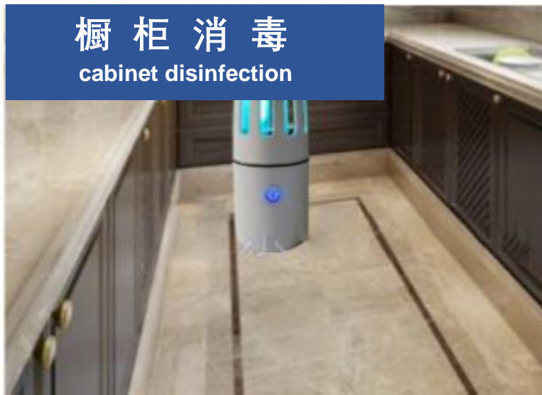
橱柜消毒 cabinet disinfection