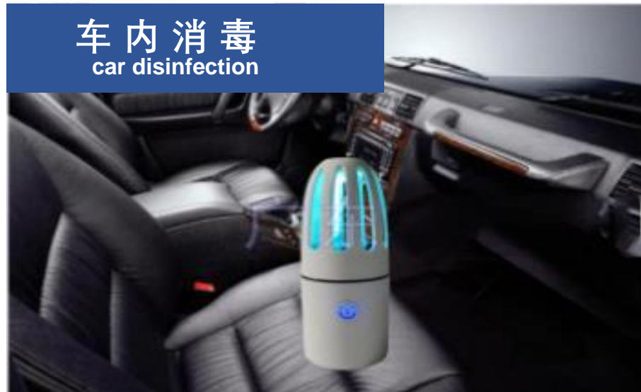
车内消毒 car disinfection