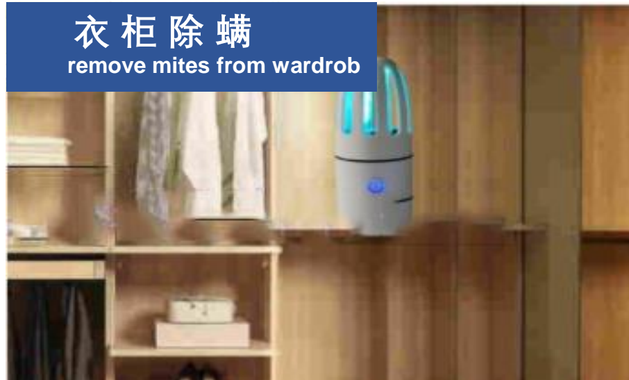
衣柜除螨 remove mites from wardrobe