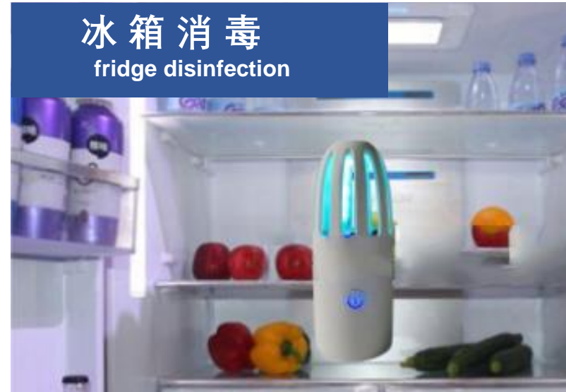
冰箱消毒 fridge disinfection