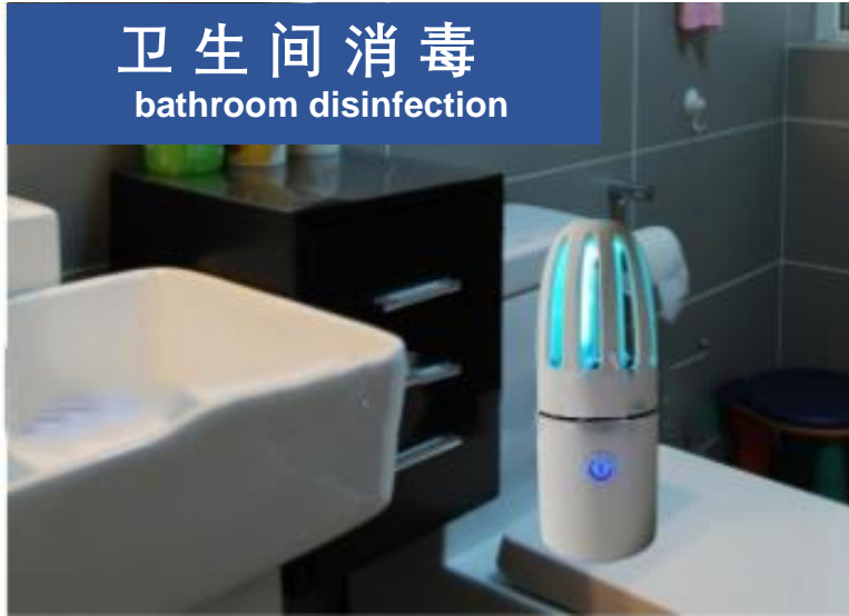
卫生间消毒 bathroom disinfection